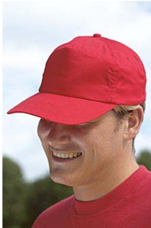
Beechfield 5 Panel Unlined Cotton Cap