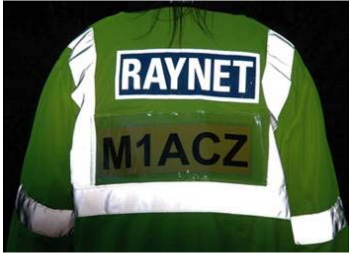
Long Sleeve Hi-Visibility Waistcoat