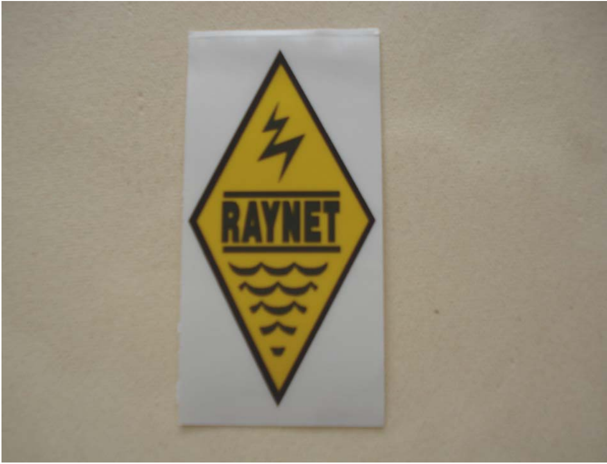
The 'RAYNET' Diamond